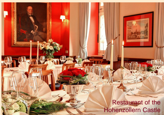
Restaurant of the Hohenzollern Castle

Pictures of the castle and text on this page by kind approval of the Hohenzollern Castle